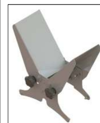
Fan Air Deflector